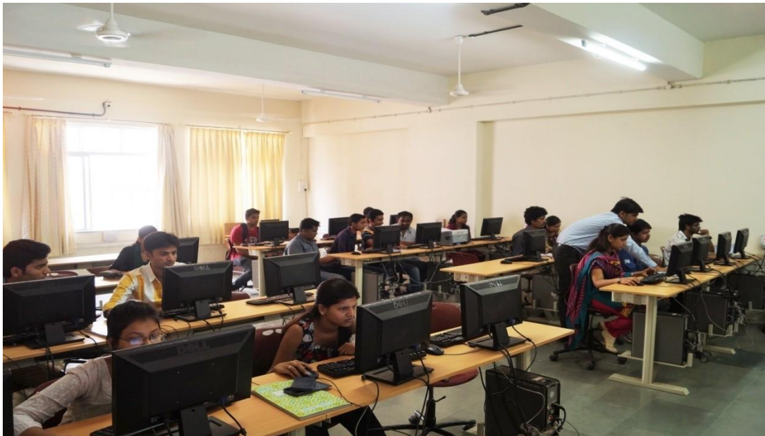
Digital Signal Processing Laboratory