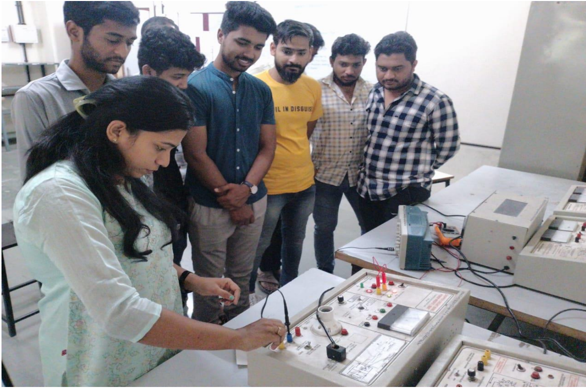
Switch Gear Laboratory