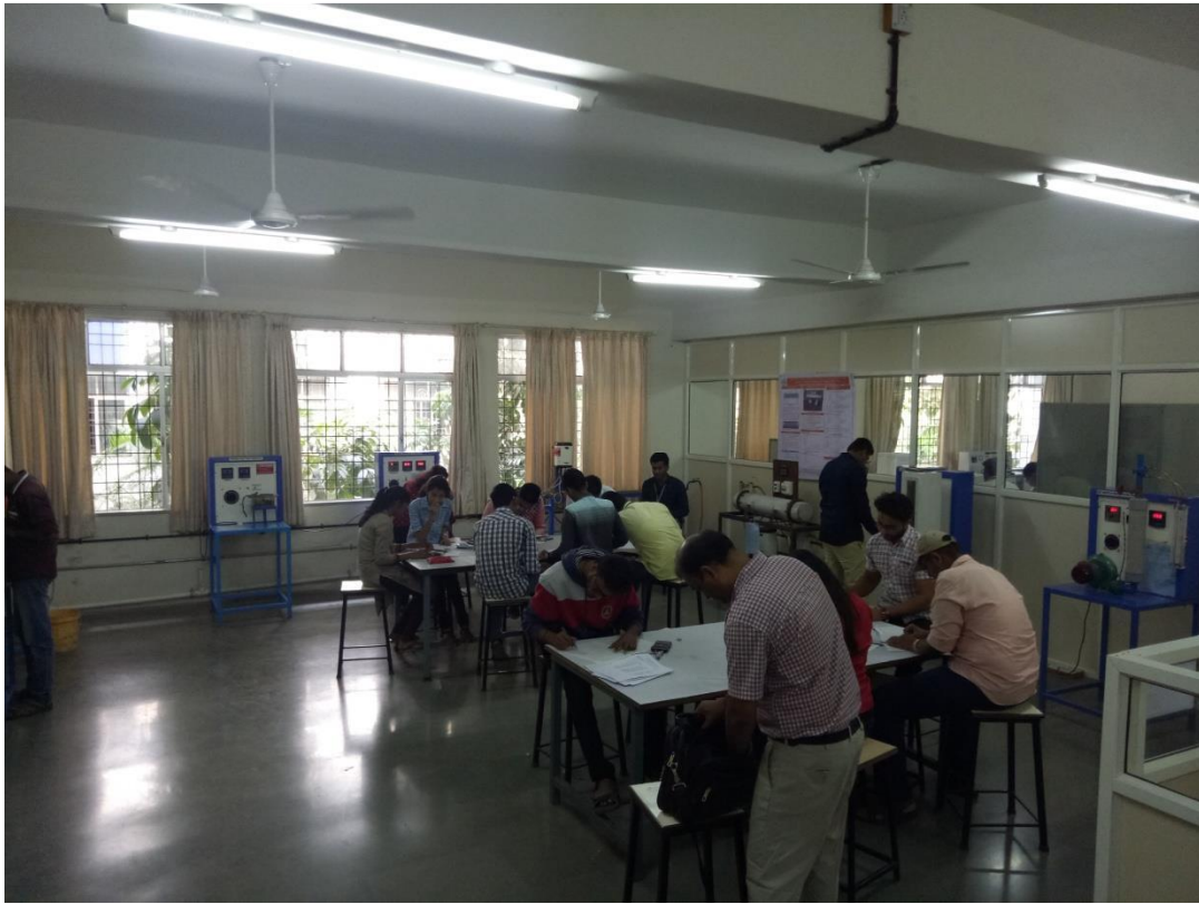
Heat Transfer Laboratory