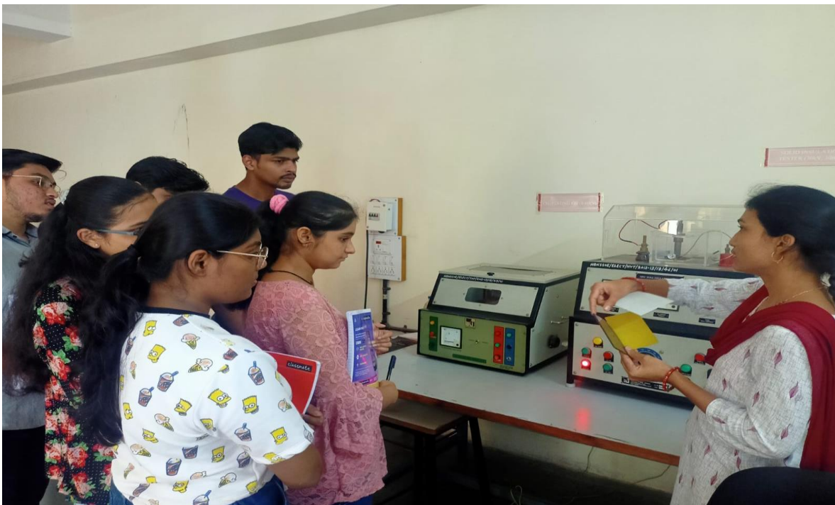
High Voltage Laboratory