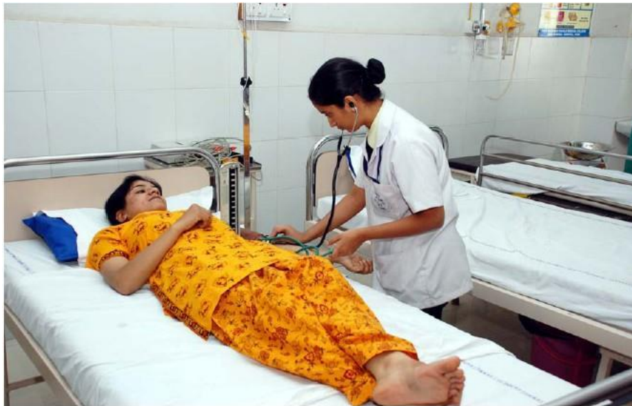
MEDICAL & OTHER FACILITIES AT HOSTEL

(Campus Clinic, Dental Hospital, Medical Stores, Laundry, Fruit & Juice Bar, Barbour Shop, Stationary Stores etc.)