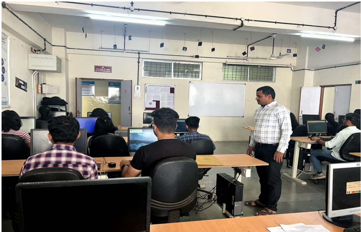
Software Engineering Laboratory