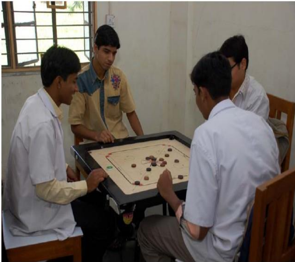
INDOOR SPORTS FACILITIES