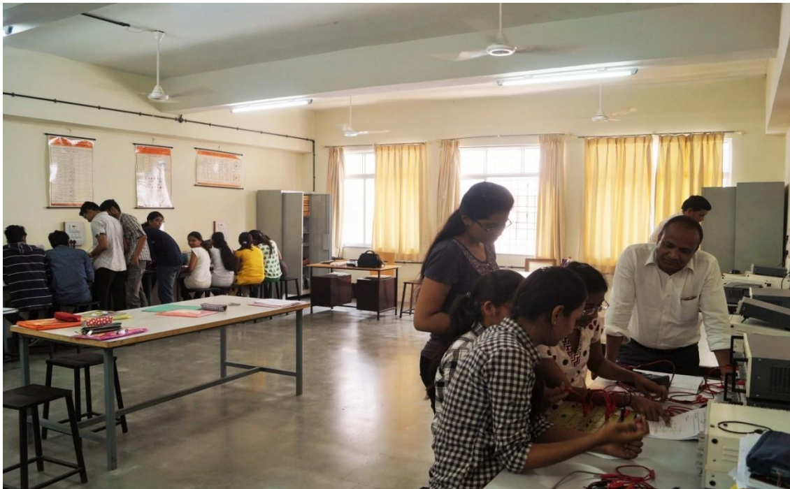
Electronics Devices & Circuits Laboratory