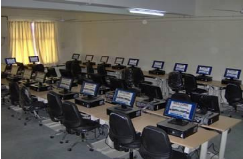
Central Computing Facility