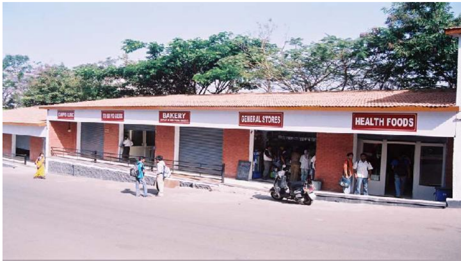
Laundry, General Stores, Fruit shops