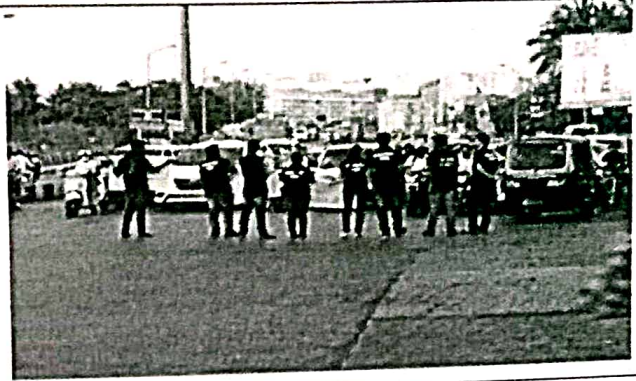
Highlights of Campaign