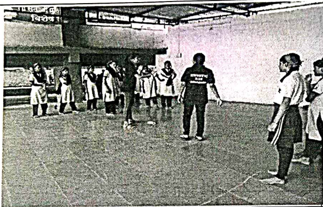
Games in School