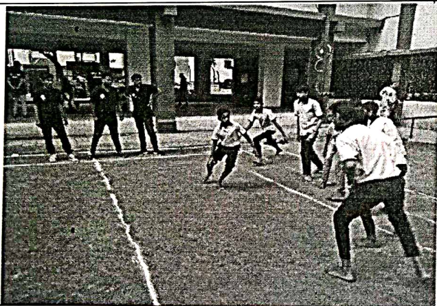
NSS volunteers with villagers