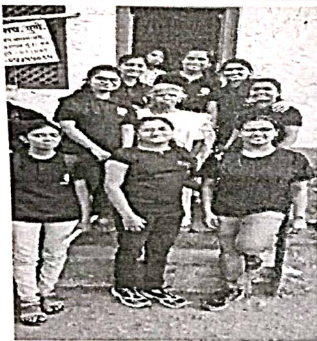
Interaction with Aaji