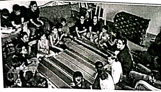
Student volunteer with "Children"