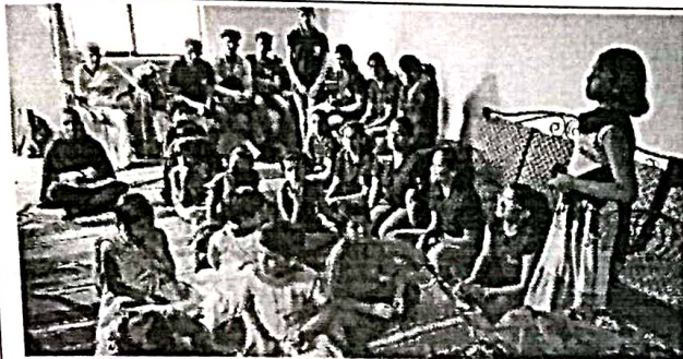
Singing performance by one of the Girl