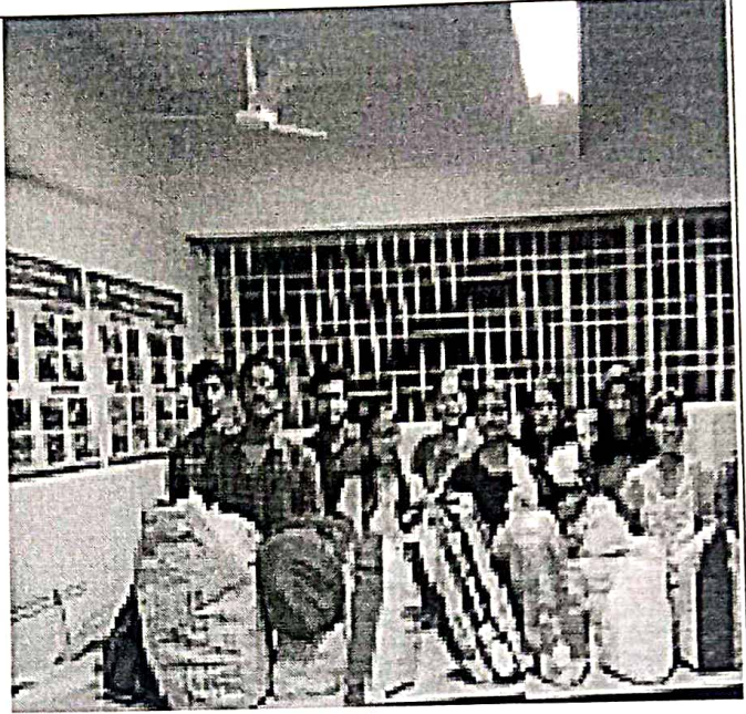
Collection Of Clothes