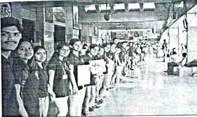
Human Chain at Pune station