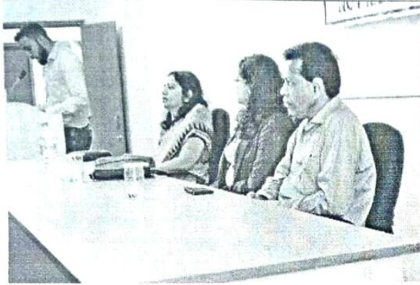
Student Introducing Guests