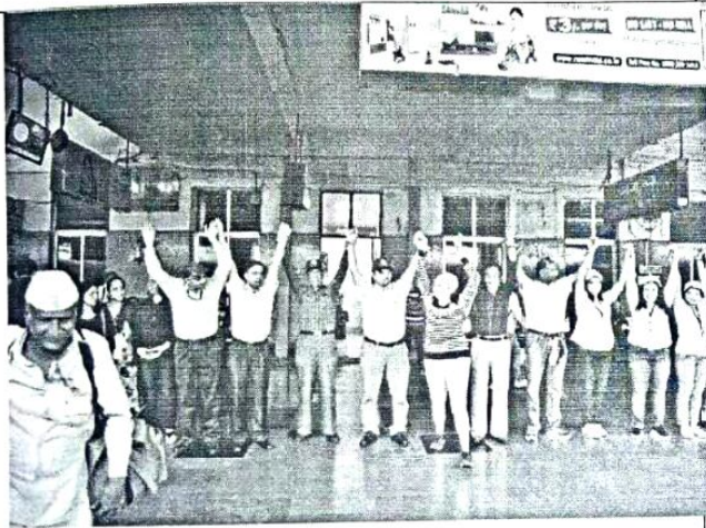
National Anthem Singing