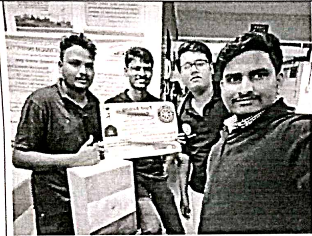
Helping desk at NBNSTIC