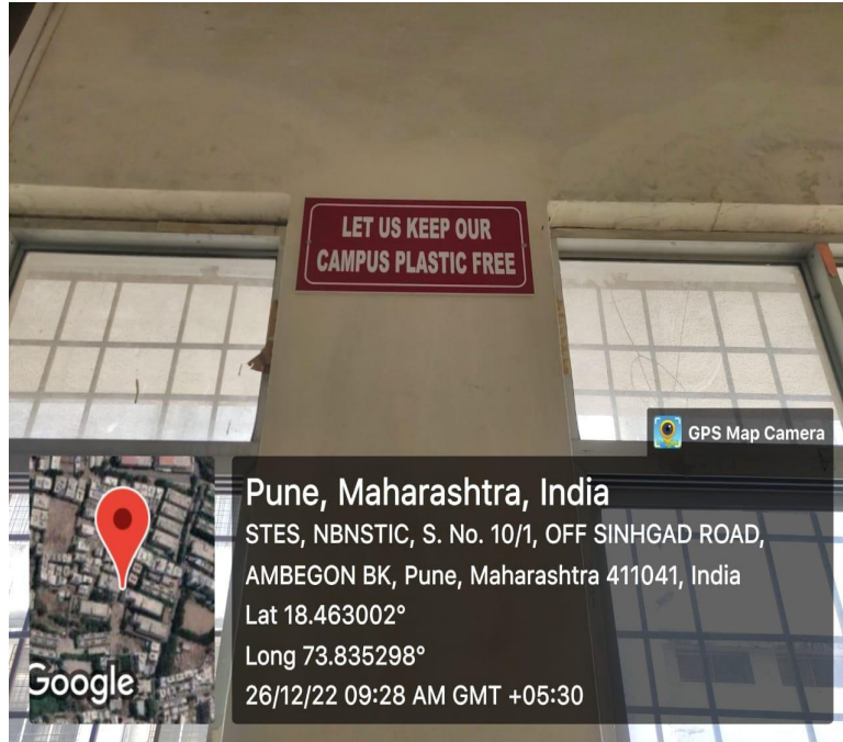
Fig. (A) Awareness Sign Board “Ban on use of Plastic”