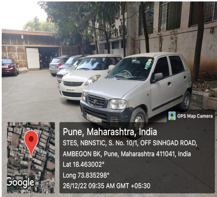
Fig. (E) Four Wheeler Staff Parking