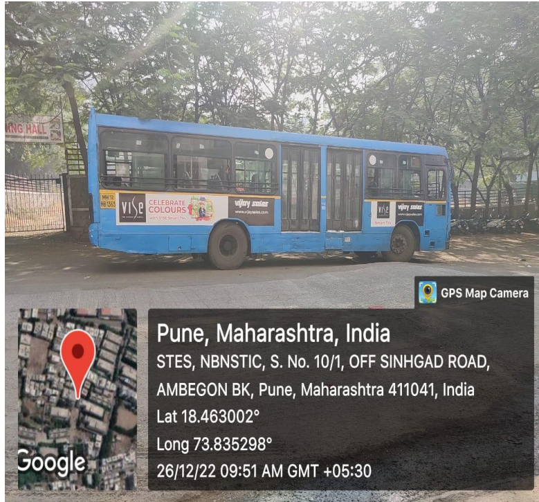
Fig. (A) Public Transport