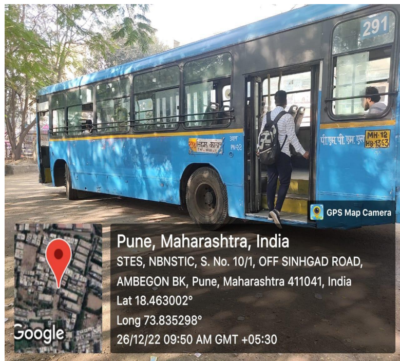
Fig. (B) Bus Stop