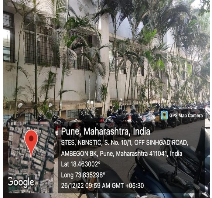
Fig. (C) Two Wheeler