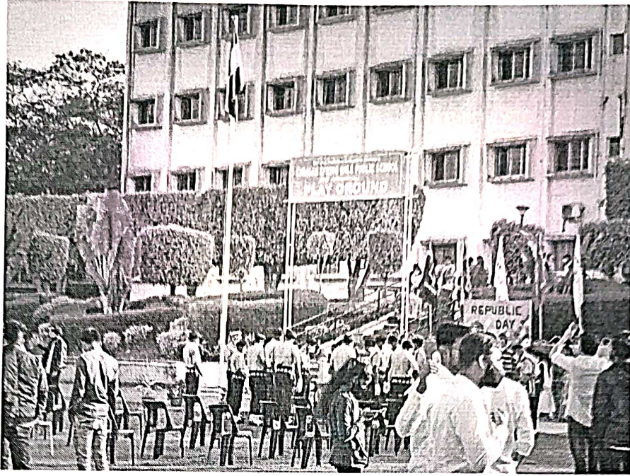
Fig. (A) Republic day