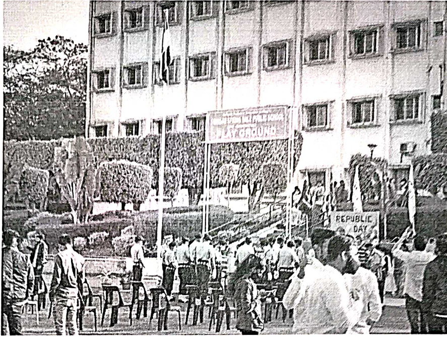
Fig. (A) Republic day