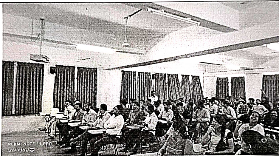
Students and faculty present at the event