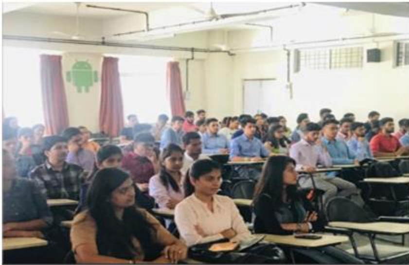
Participants of guest lecture