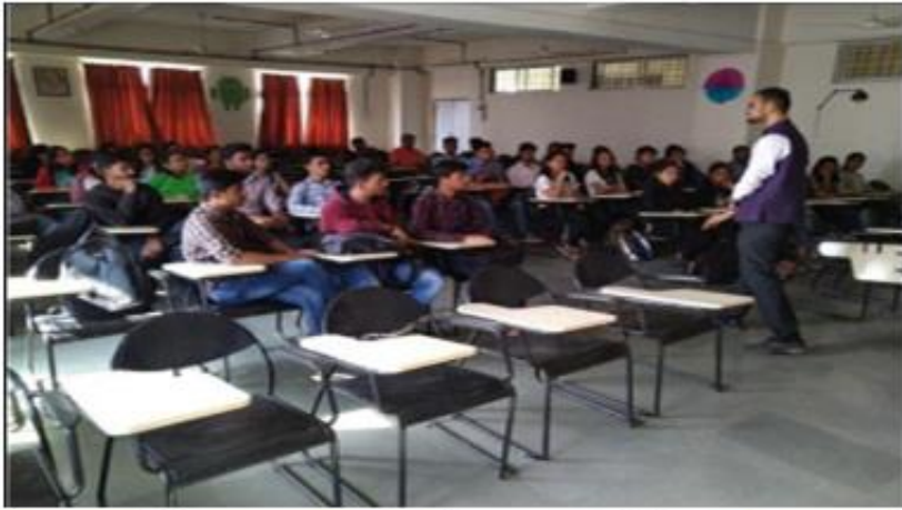
Speaker explained importance of etiquettes